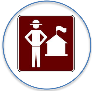
Picnic Grove - Registration Area