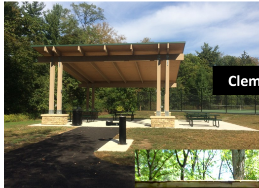
Clem Macrone Park

*Please call us if there are other facilities you wish to reserve.